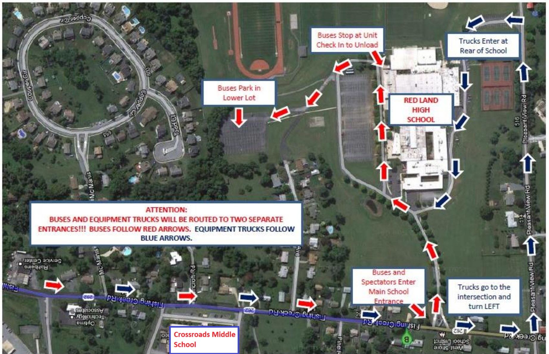
MAP FOR BUS DRIVERS AND EQUIPMENT TRUCKS